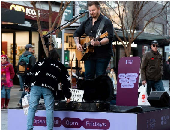
Rundle Mall Activations

A range of activations have been delivered in the Rundle Mall precinct increasing vibrancy and driving foot traffic and spend, including: