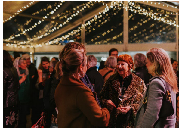
Sponsored Events and Festivals

Fruchoc Appreciation Day held on 27 September in Rundle Mall was a day where South Australians could gather together to celebrate the apricot and chocolate icon. Free activities included face painters, music, photobooth, games and giveaways.