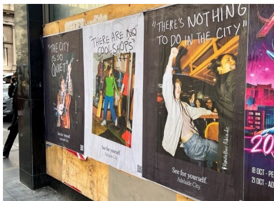
See for Yourself Campaign

The 'See for Yourself' campaign targeted at 22-49 year olds across Adelaide, challenged perceptions that the city is 'bland, boring and sleepy', particularly in winter. The campaign was in market from June to July to coincide with traditionally quieter period for city visitation and targets an audience that research shows has the desire and disposable income to enable them to experience the city. The campaign profiled over 115 business and generated 11,900+ visits to the SeeADL.com.au landing page, converting to 2,465 leads for city operators. The paid advertising resulted in a reach of 4.7m impressions (how many times an ad is viewed by users).